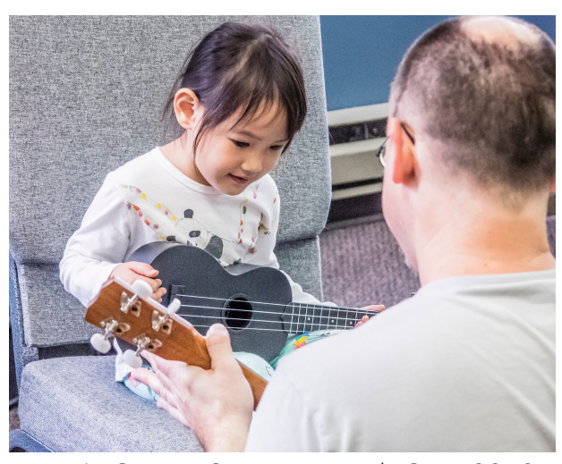
Music Center Open House | Sept 2019