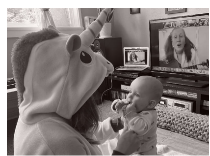
Virtual Music Together class | Spring 2020