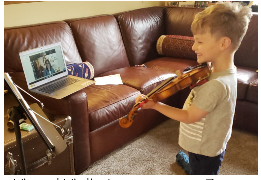
Virtual Violin Lessons over Zoom

On March 12th, Music Center's doors closed, but the music never stopped. Our amazing faculty and students have been creative and flexible. Individual instruction transitioned smoothly using digital technology. Ensemble Directors were innovative and resourceful, understanding the limitations which virtual ensembles faced and transitioned their teaching to focus on education over performance. Our goal was to keep our community connected and out of this we have built a stronger bond, together.