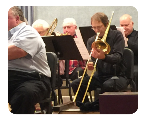
New Perspectives adult class enrollment up 23%