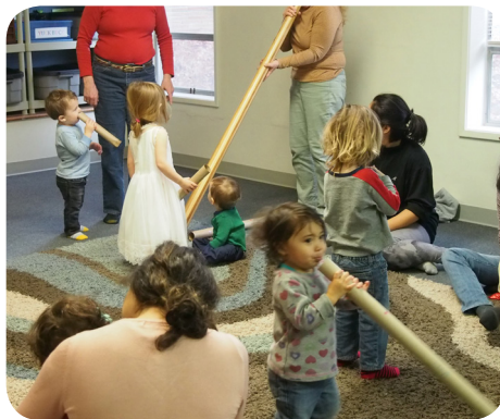
$28,694 in need-based tuition assistance granted to 70 students