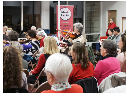
Annual Messiah Sing & Play Along