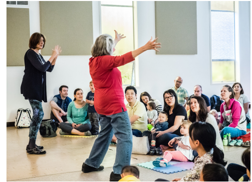
Music Together at the Open House