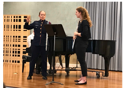
U. S. Coast Guard Flute Masterclass