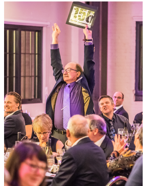
A Night in the City Gala - 2018