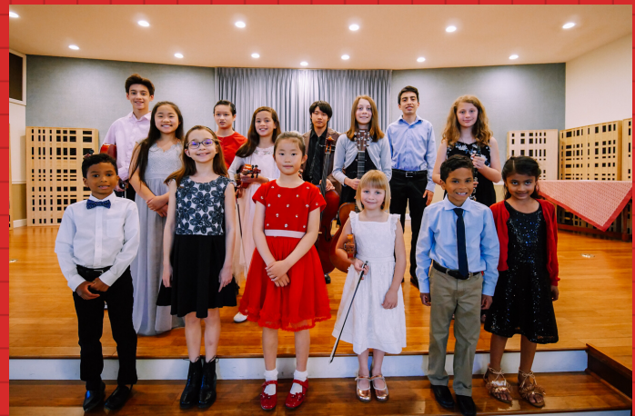
Honors Recital Performers - 2019

Music Center of the Northwest is a non-profit community school located in North Seattle. We believe in the transformative power of music in the lives of people and our community. With a commitment to music education and live performance, Music Center provides access to exceptional musical experiences for people of all ages and abilities, regardless of means.