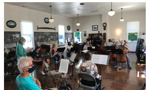
(Left) Piano Trio at Honors Recital | May 2022 (Right) Oak Lake Strings at Camano Island | Summer 2022