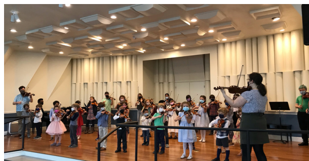
Suzuki Violin Group Class Performance | June 2022