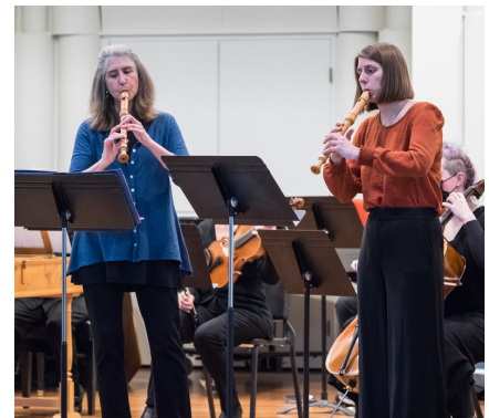
Haydn & Beyond Concert | November 2021