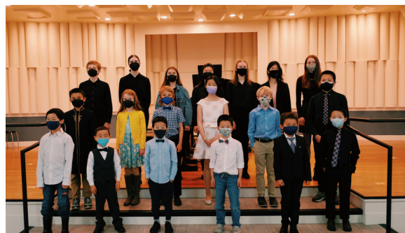
Honors Recital Performers | May 2022