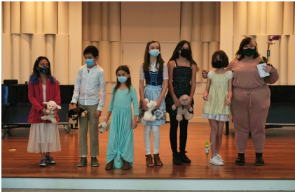
Northwest Scenes - An Introduction to Musical Theater | Winter 2021