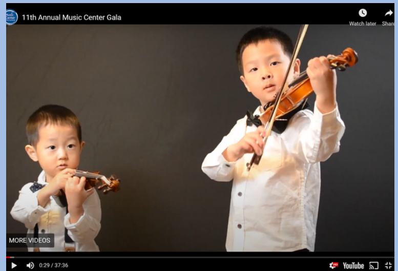
11th Annual Gala (Virtual) | November 2021